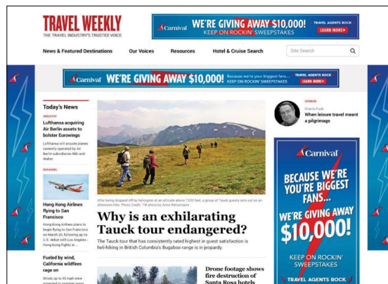
Home Page Takeover