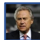
Philip F. Anschutz